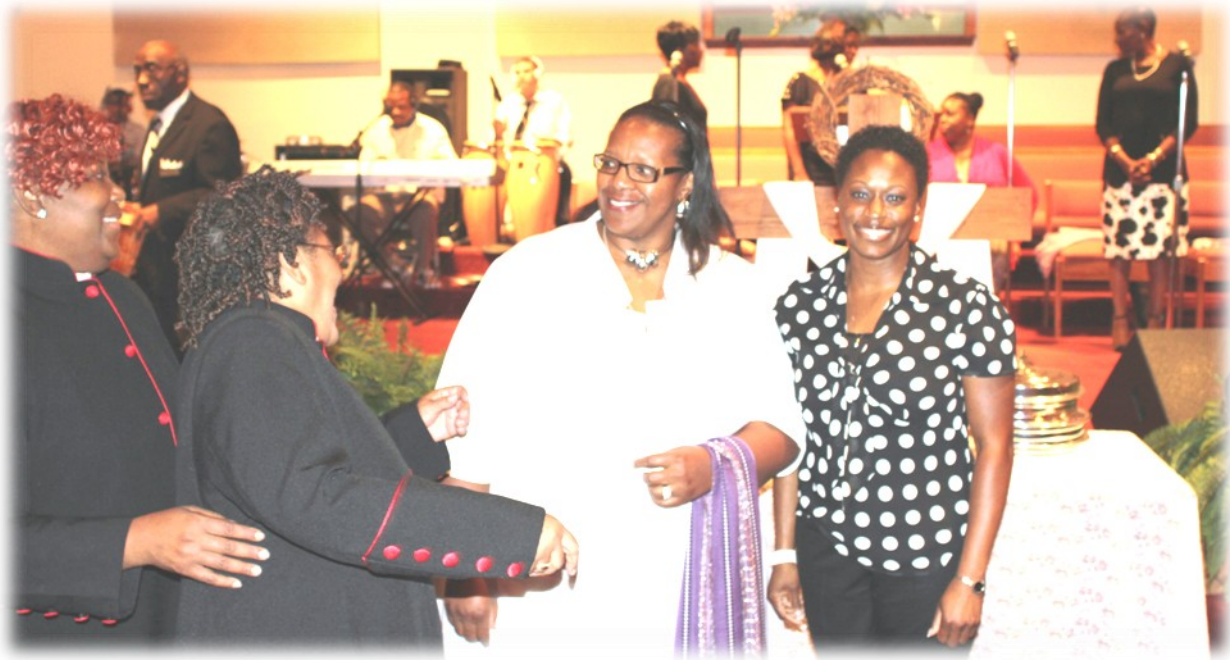
November PLACE Workshop Attendees